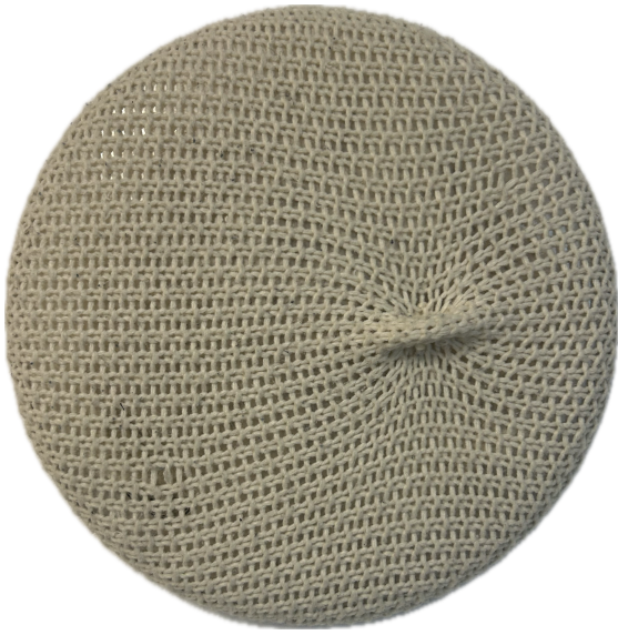
untitled 4# 2025 - Brussels