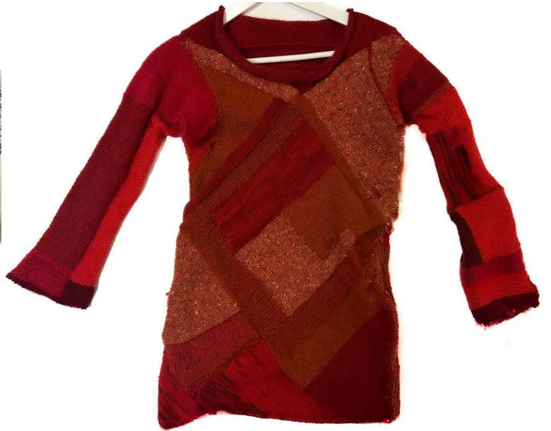
Knitted patchwork pull (wool) - 2024 Antwerp