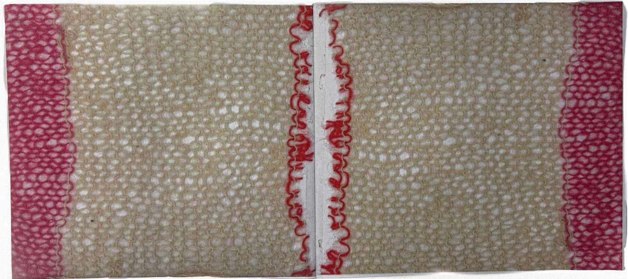
papercut 2025 Brussels