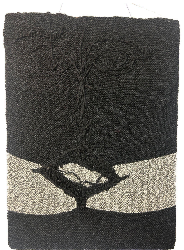
dad 2025 Brussels