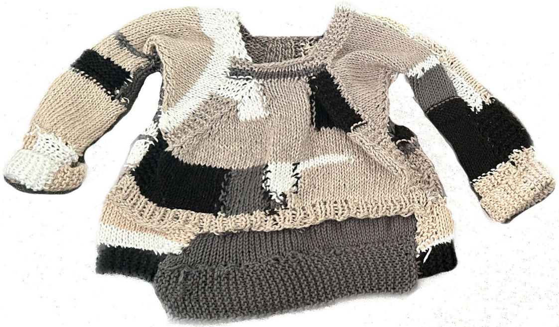
Knitted Patchwork sweater (Cotton) - 2024 Antwerp