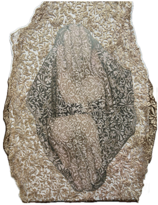
Untitled 3# - 2025 - Brussels