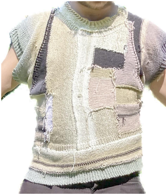
Knitted patchwork T-shirt (Cotton) - 2024 Antwerp