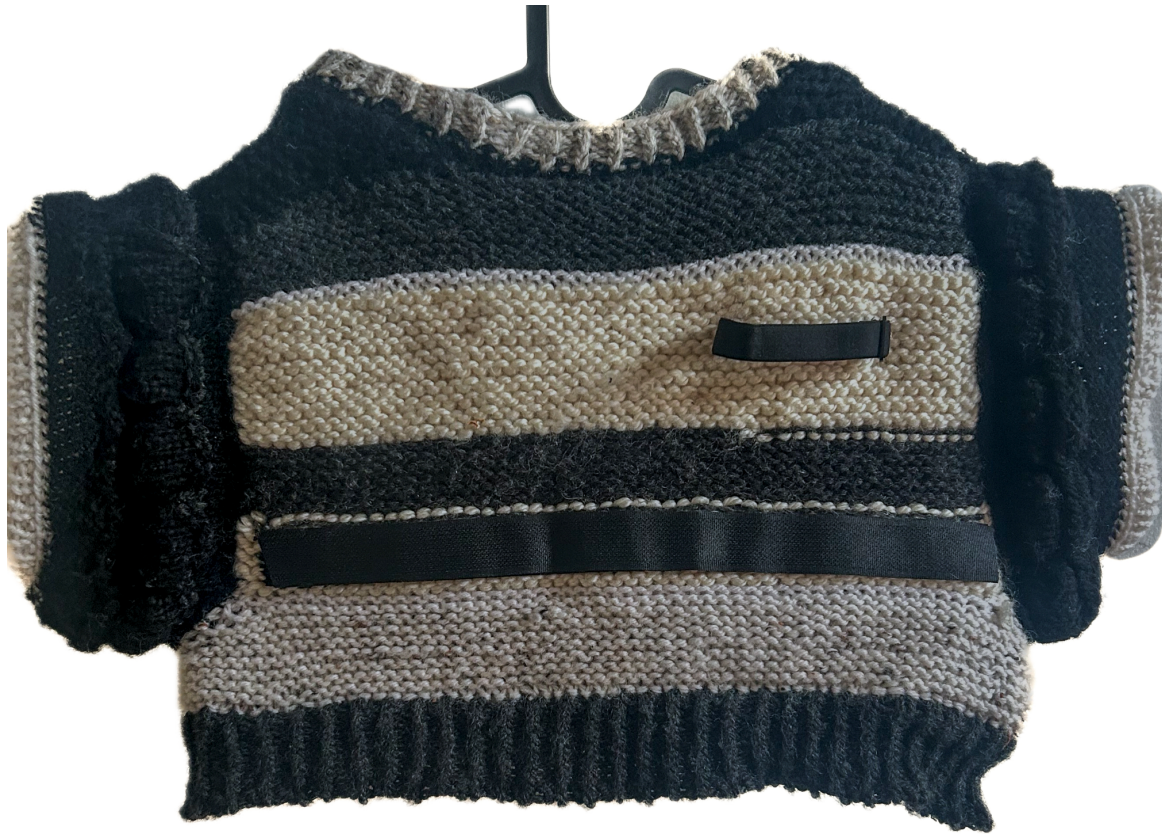
Knitted crop top for police uniform (recycled wool) - 2024 Antwerp