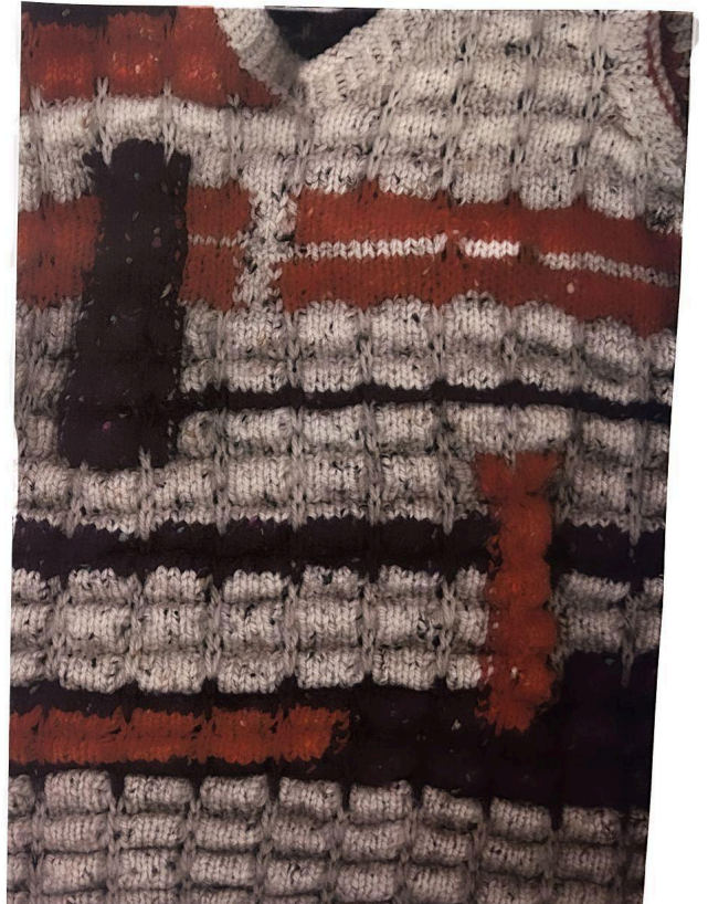
Untitled #2 2025 Brussels