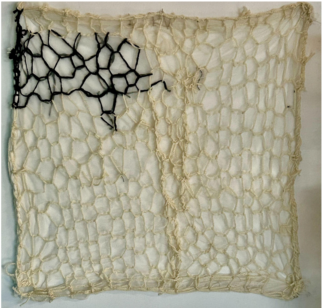
Untitled 5# - 2025 - Brussels