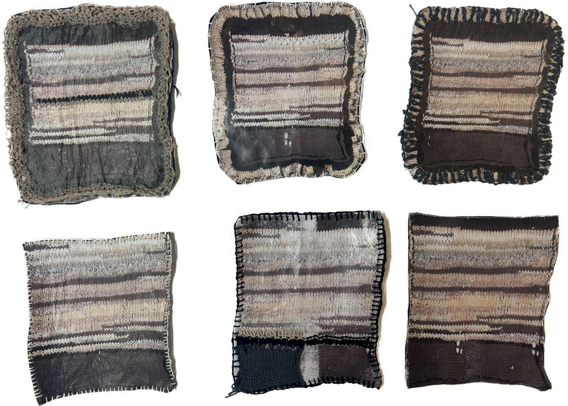
Study of defragmented work 2025 Brussels