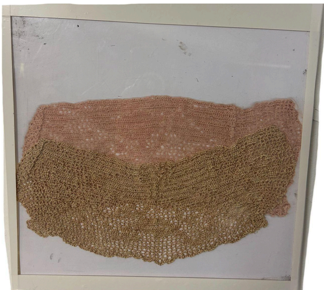
Bandaïd 2025 Brussels