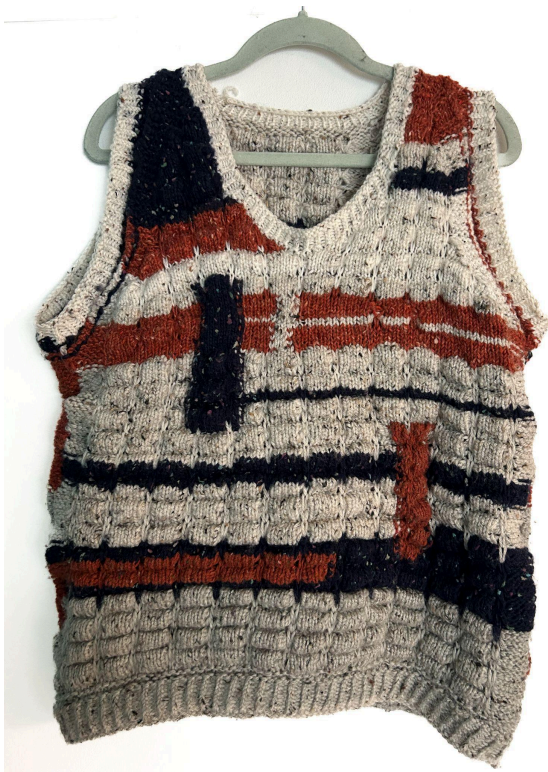
Knitted Bubblestich spencer (Wool) - 2024 Antwerp